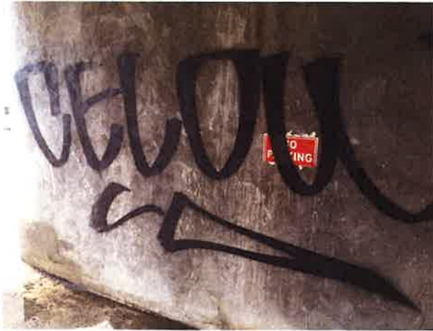
Traveling east on Vine St.Y Garage