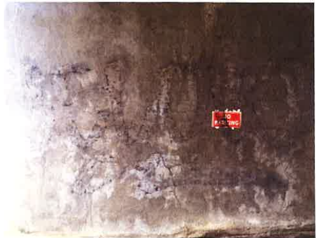
Y Garage after using pressure washer